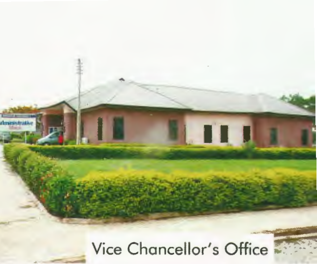
Vice Chancellor's Office