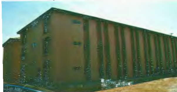
College of Medicine and Health Sciences Multipurpose Building Jos Campus