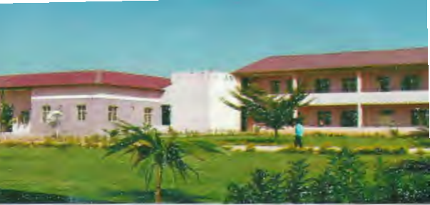
Faculty of Science and Technology