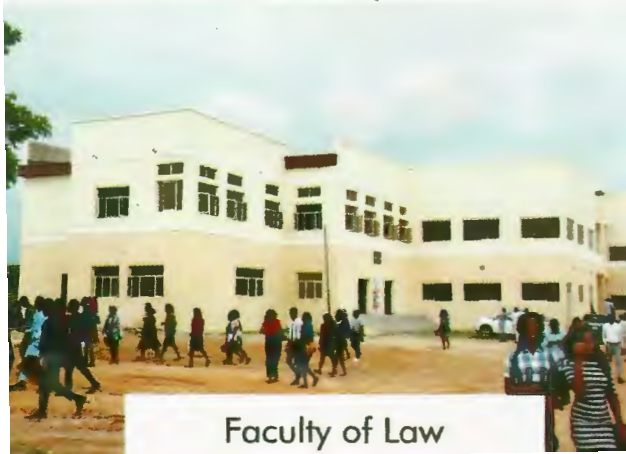
Faculty of Law