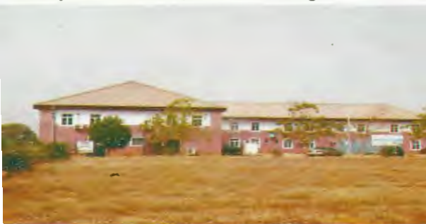
Faculty of Pharmaceutical Sciences