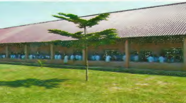
Faculty of Humanities, Social & Management Sciences