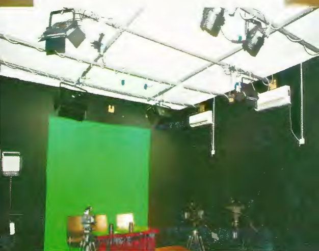
Mass Communication Studio