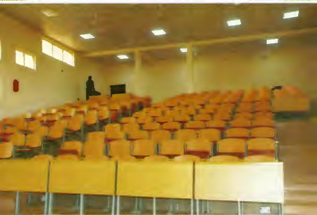
Lecture Theatre, Faculty of Law