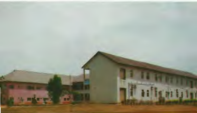
College of Medicine and Health Sciences Karu Campus