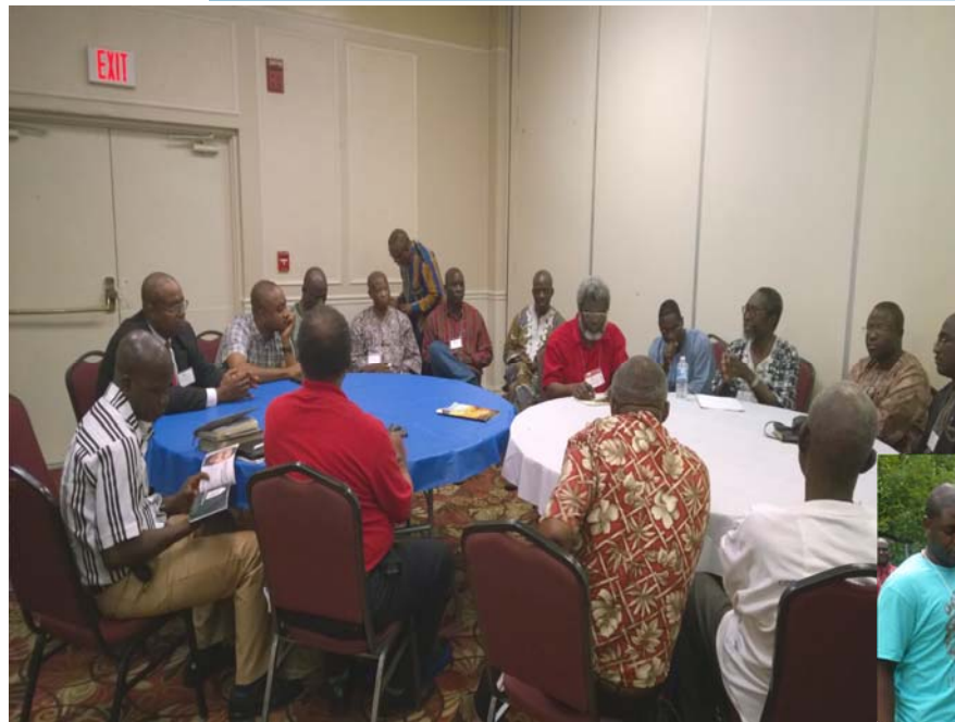
ECWA Men's Ministry (above)