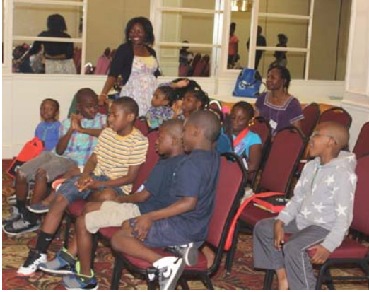
ECWA Children at the Maryland Conference, 2014