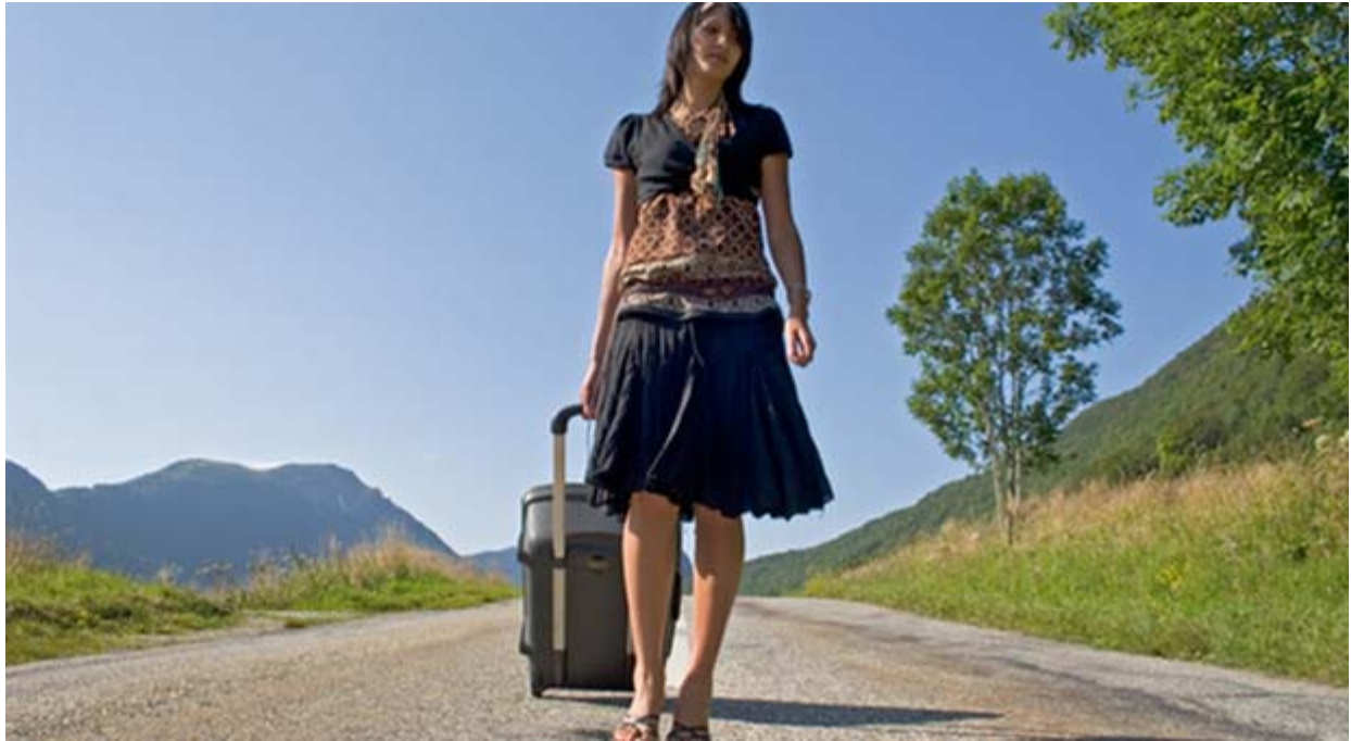
Are you somewhere in life that you didn't plan on being?

It was with great shock I called one of my good friends when we were in college and said, "I really like this guy, he is amazing, goodness I like him so much I could marry him, but...he wants to be a pastor!" He stole my heart, what can I say.