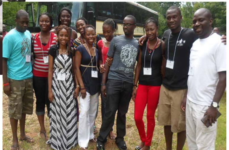
ECWA Youth Ministry (below)