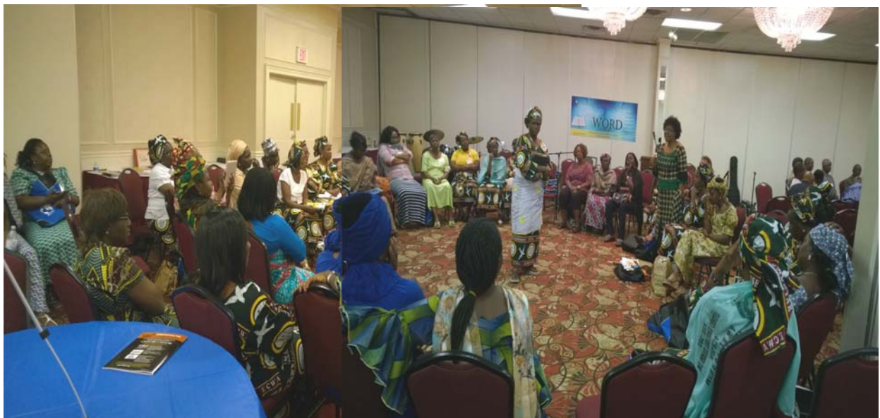
ECWA Women's Ministry